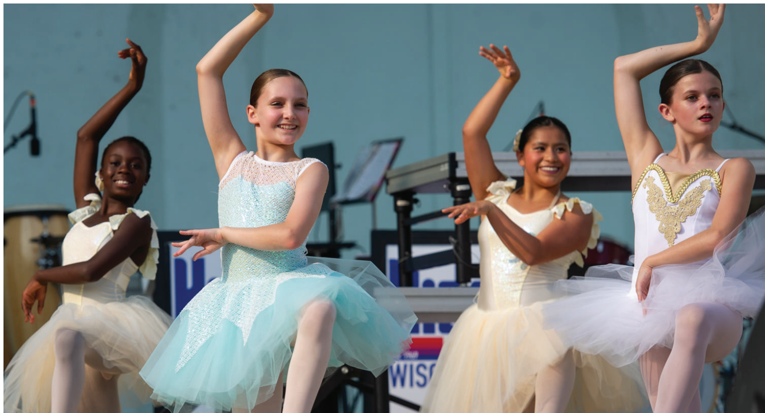
Four young performers hold a final pose at the MKE Arts Spotlight.

We strive to go beyond the extraordinary, delivering free performing arts programming to enrich any age and ability level.