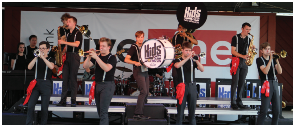
2021 Kids band wows Wisconsin State Fair audiences

Thank you to all who contributed to the continued success of The Kids From Wisconsin.