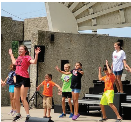
Workshop in Kenosha, WI