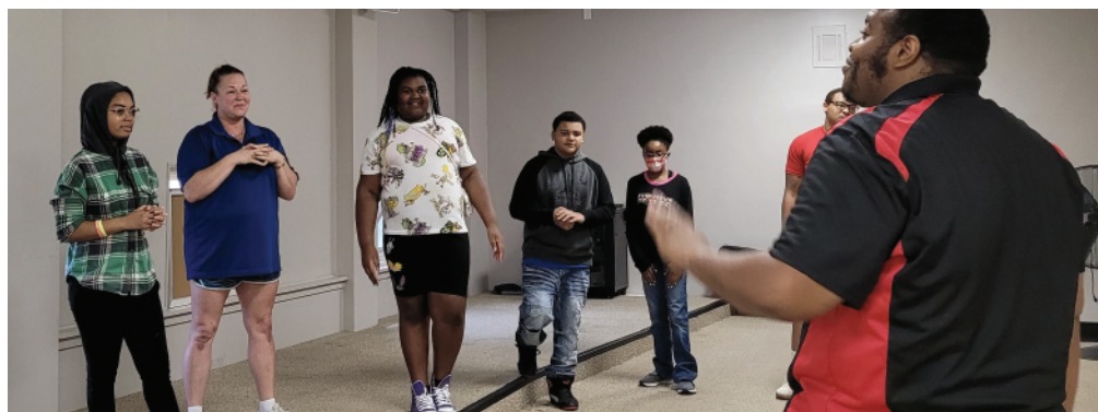
Music With My Friends at Lighthouse Youth Center

Since our last report, four teaching artists were trained and successfully launched seven residencies at various schools and centers. These residencies prove to be an integral component, to